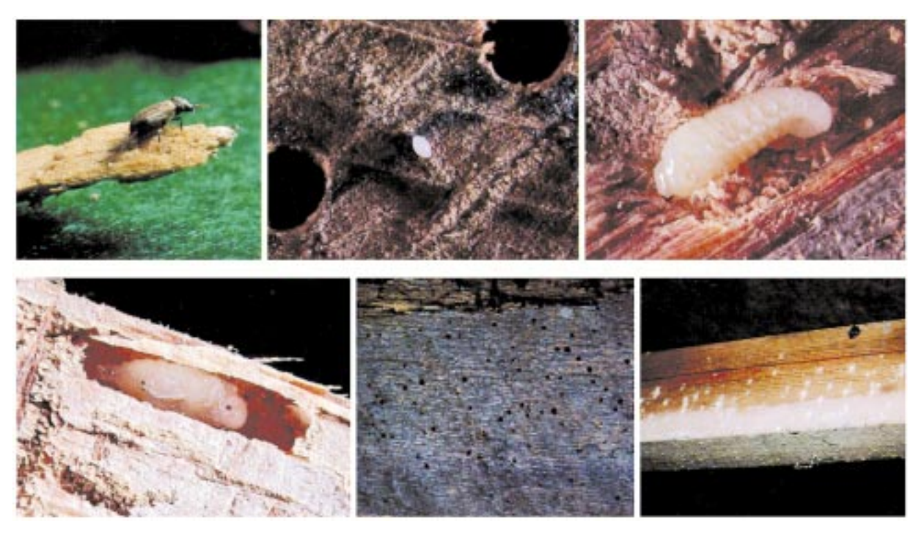
Fig. 3. Hemicoelus gibbicollis adult, top left. Fig. 4. Anobiid egg, top center. Fig. 5. Anobiid larva, top right. Fig. 6. Anobiid pupa, lower left. Fig. 7. Adult beetle exit holes, lower center. Fig. 8. Frass (feces) pushed from holes by larvae, lower right.

moisture, improves ventilation, replaces infested wood with pressure-treated wood, and applies chemical controls at the proper time will go a long way to reducing anobiid infestations in structures.